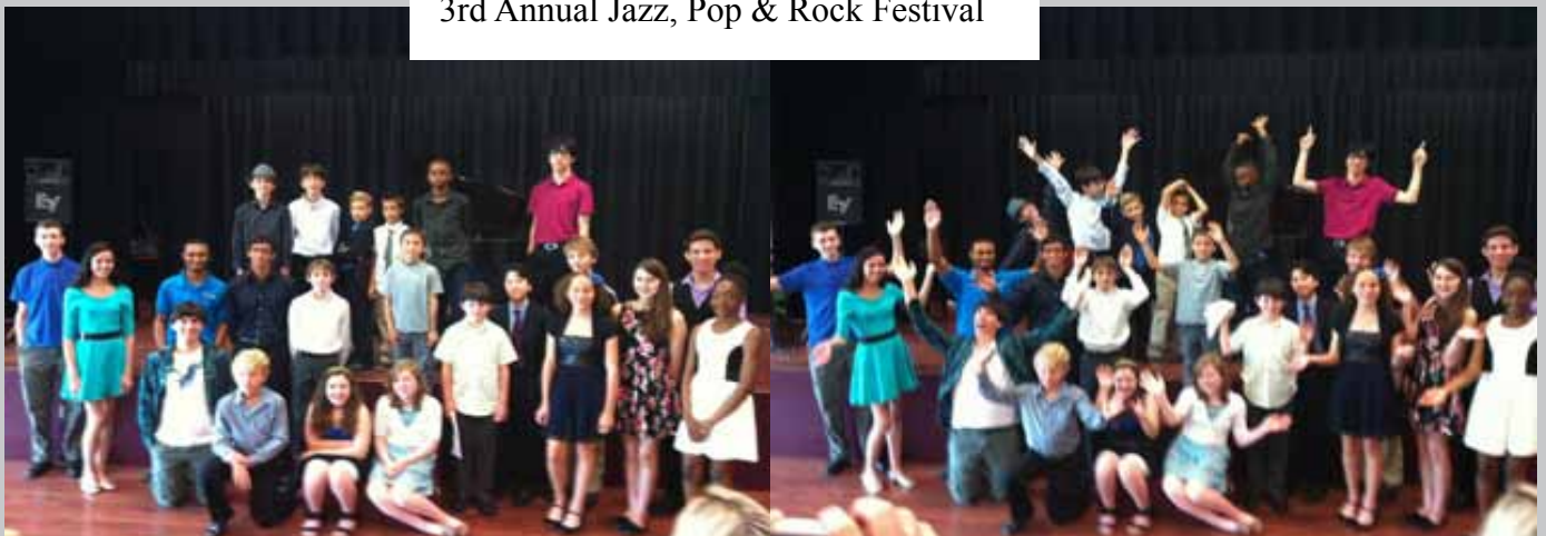
3rd Annual Jazz, Pop & Rock Festival