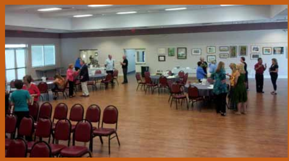
The lovely Herb Skolnick Community Center donated their facilities and beverages for our event.